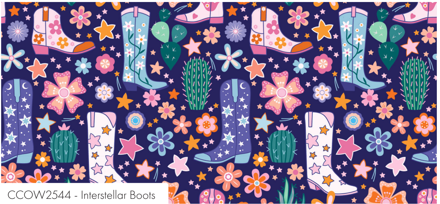
CCOW2544 - Interstellar Boots