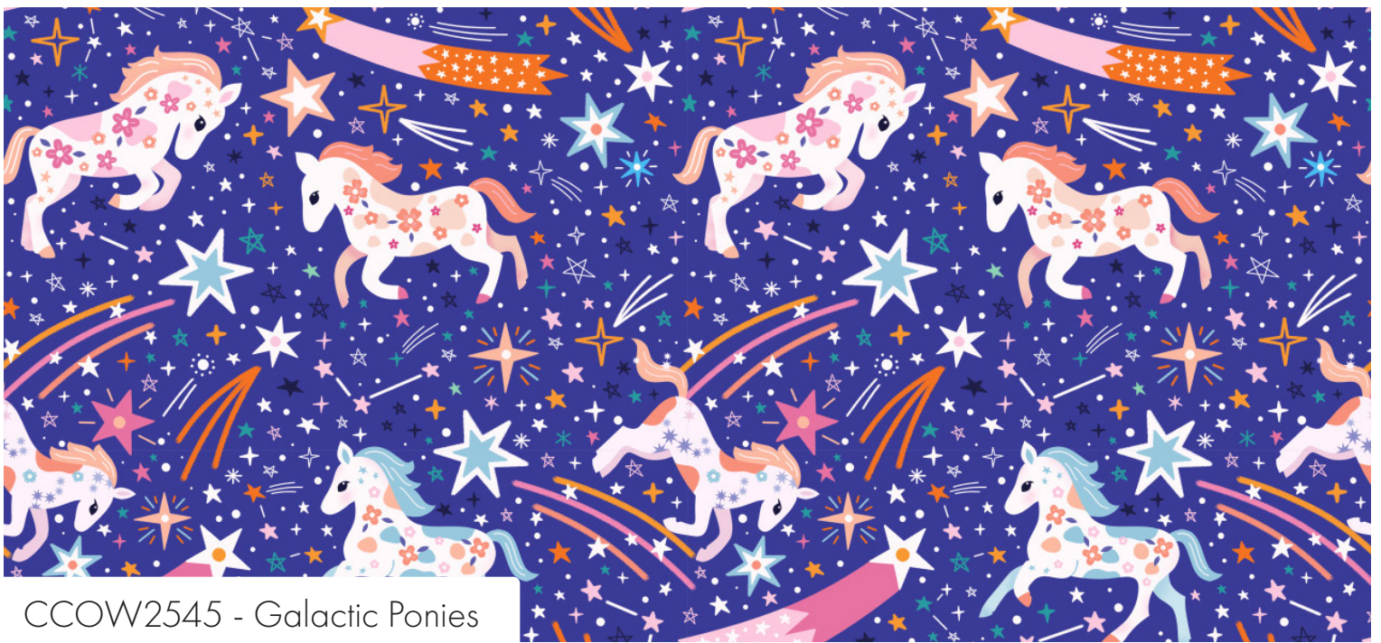
CCOW2545 - Galactic Ponies