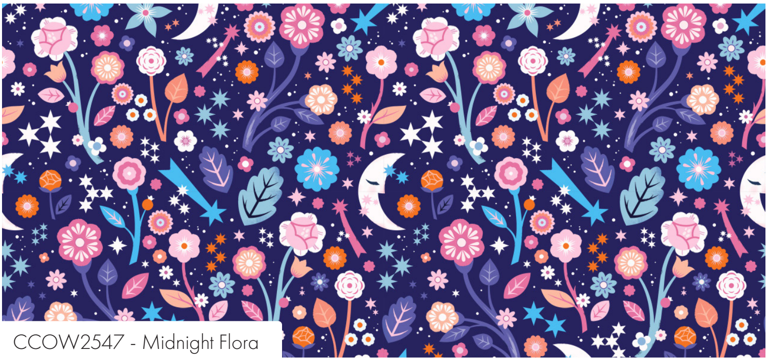
CCOW2547 - Midnight Flora