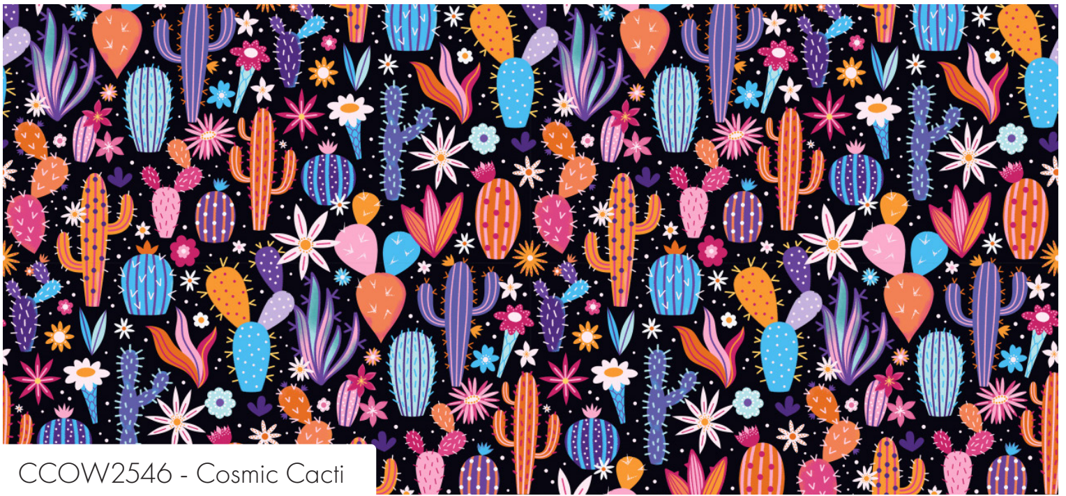
CCOW2546 - Cosmic Cacti