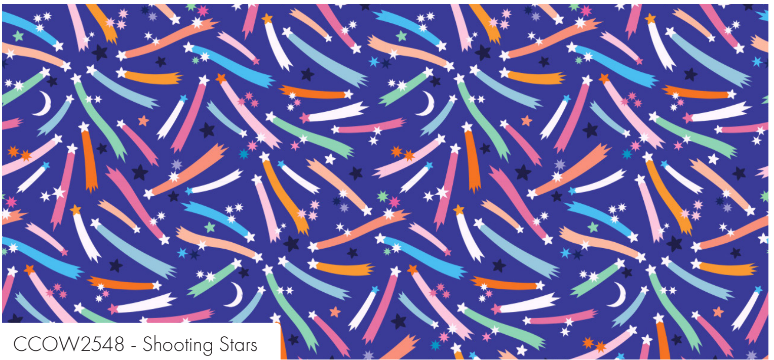
CCOW2548 - Shooting Stars