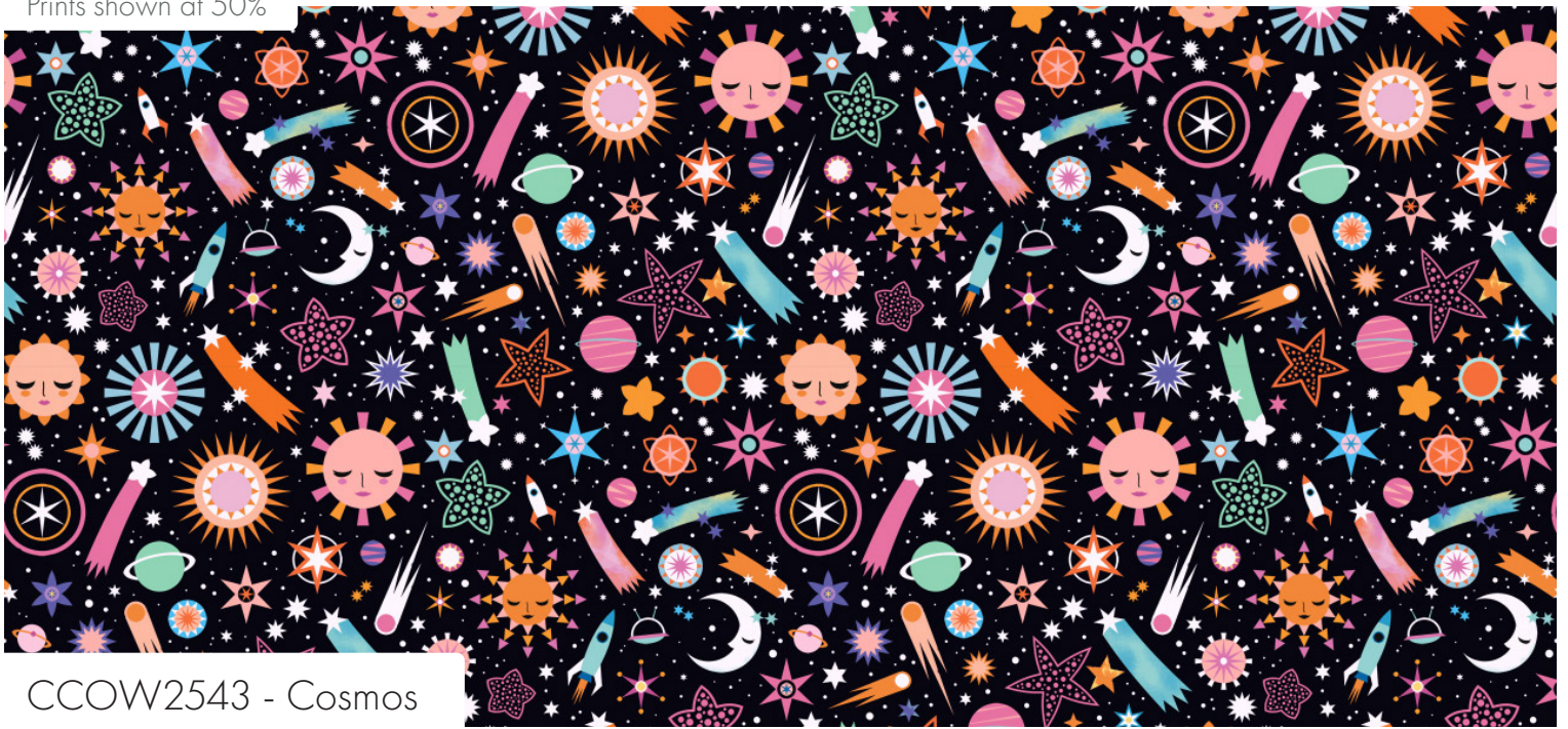
CCOW2543 - Cosmos