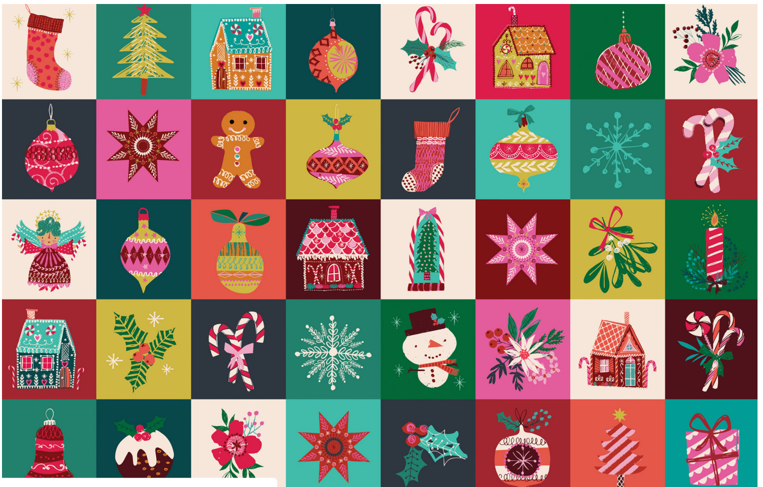
CANDY2508 (5" x 6" Blocks)